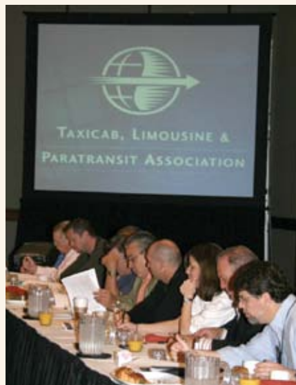
The Board of Directors met at the Spring Conference in Kansas City.