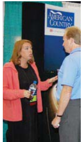
Exhibit Hall Schedule

TAXICAB, LIMOUSINE & PARATRANSIT ASSOCIATION